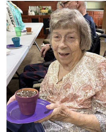
Earth day flower seed planting, multi-media crafts and ice cream in the sun