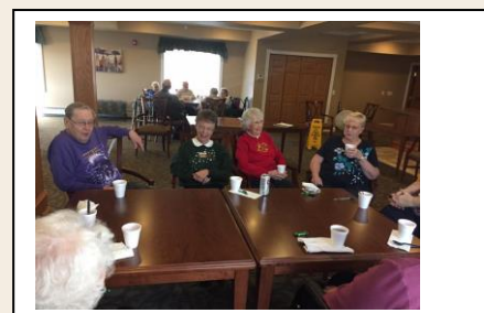
We love our Bailey's Buddy Social.