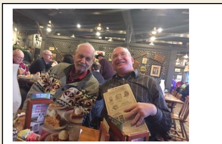
Enjoying a meal with friends at The Cracker Barrel