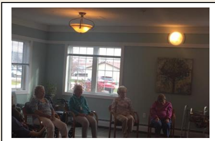
Enjoying time with friends and doing a little exercise.

Oak Terrace Resident Doing What we do best....Having a good time.